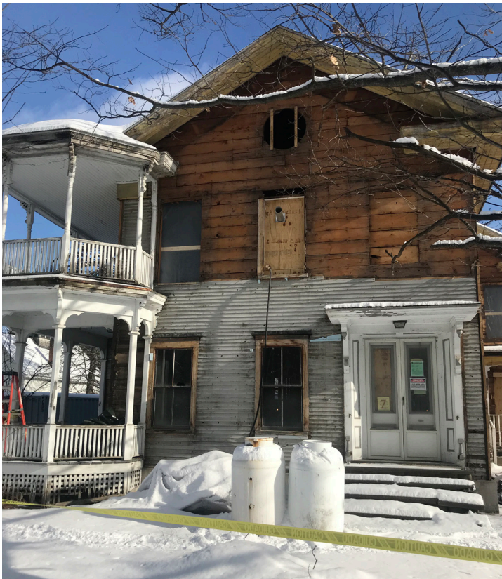
Randolph: Historic home on Main Street will provide four homes with permanent supportive services for homeless individuals with chronic mental illness.