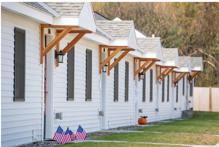
Brattleboro: Great River Terrace—22 new homes and a community center for formerly homeless individuals.