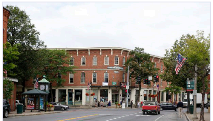
Bennington: Redevelopment in the heart of downtown