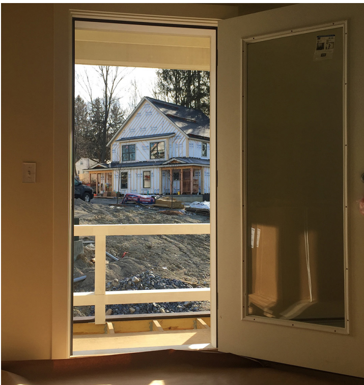
Bennington: Monument View—24 new homes for families.