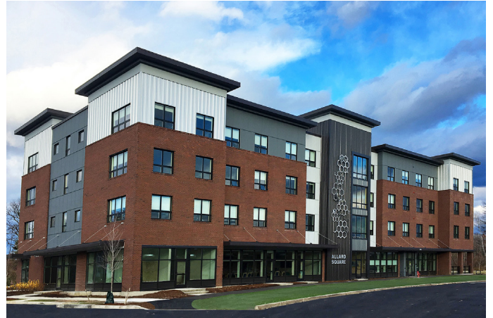
South Burlington: Allard Square—39 new homes for seniors

The bond proceeds are expected to be fully committed by the end of the year.