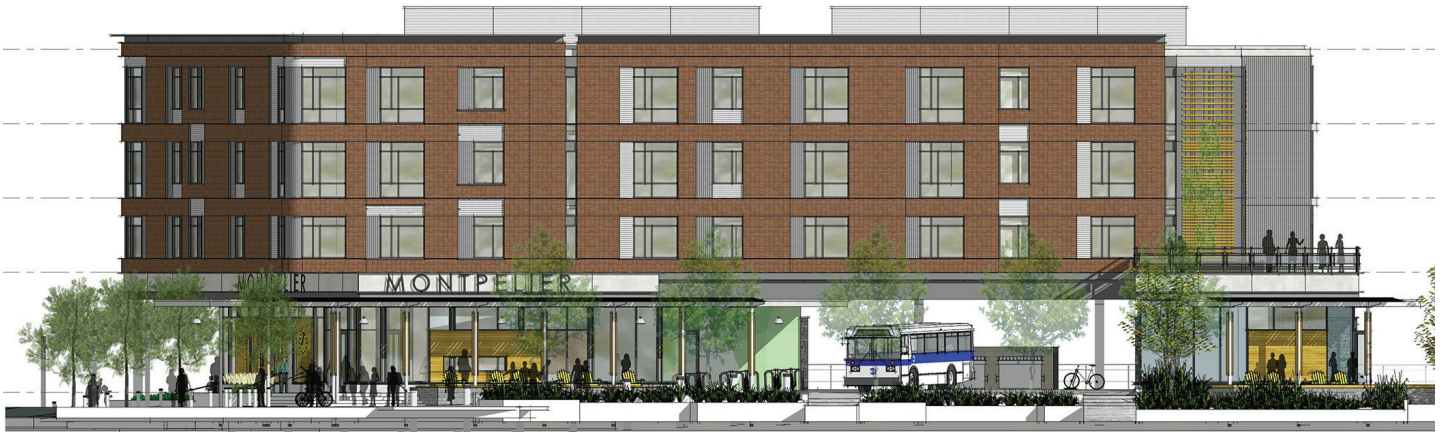
Montpelier: Taylor Street—30 homes affordable to a range of incomes above a new transit center.