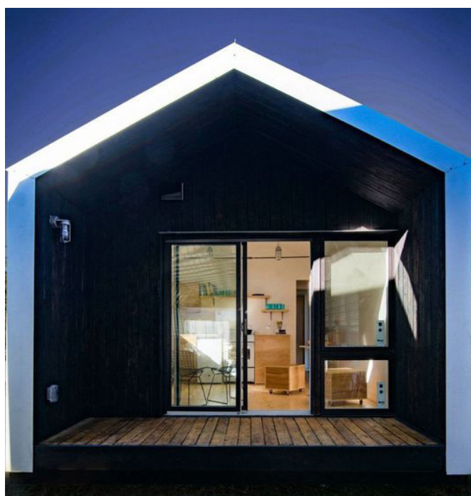
Barre: Tiny homes to be built by Norwich University students.