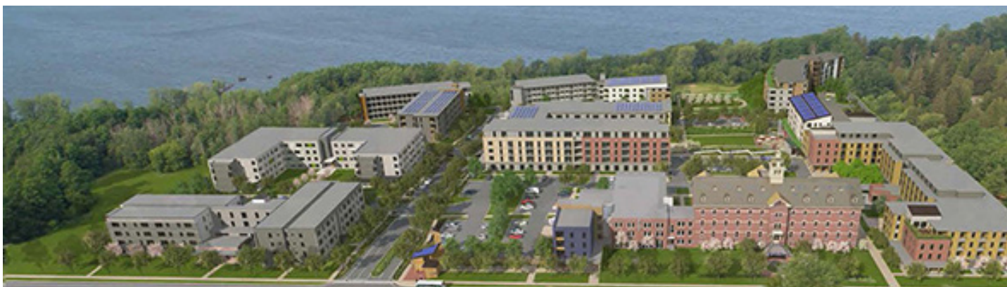
Burlington: Cambrian Rise—a new mixed-income, intergenerational neighborhood with affordable apartments and condominiums