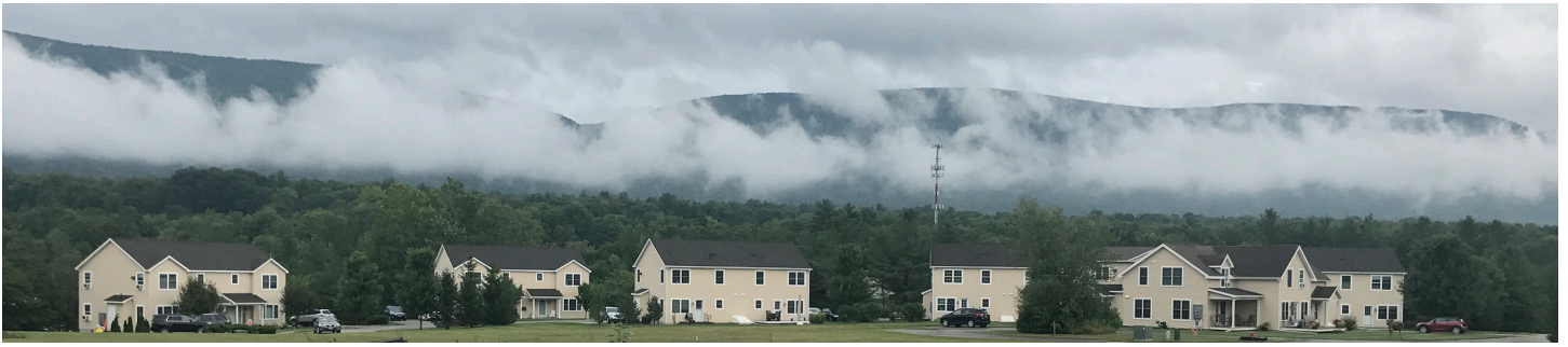
Manchester: East Branch Farms - affordable homeownership