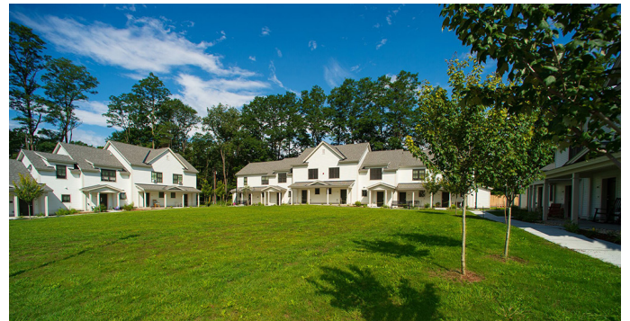
Putney: Putney Landing—workforce housing