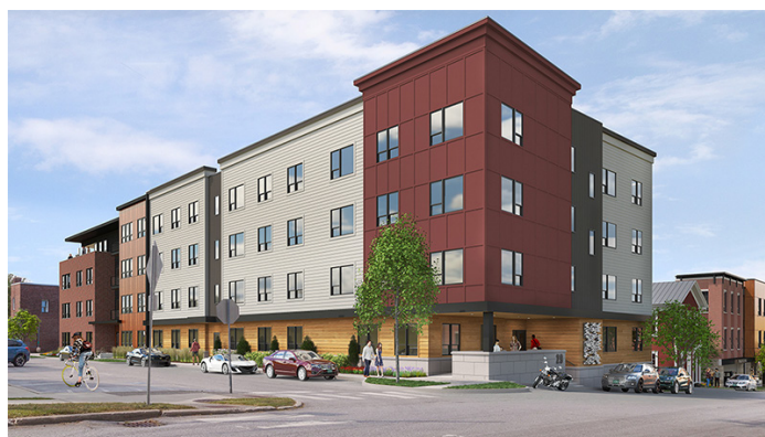
St. Albans: Maiden Lane Apartments—30 new homes for households at a range of incomes to replace substandard housing. An adjacent building by a private developer will have 24 apartments for moderate income households.